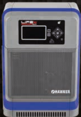
3-PHASE LifeiQ™ CHARGER