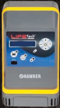
1-PHASE Lifetech™ CHARGER

Find out more about our products and services at www.enersys.com