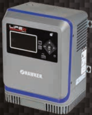
1-PHASE LifeiQ™ CHARGER