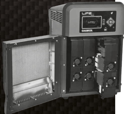
3-PHASE 4 BAY CABINET INTERIOR